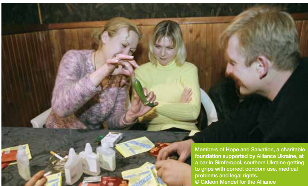
Members of Hope and Salvation, a charitable foundation supported by Alliance Ukraine, at a bar in Simferopol, southern Ukraine getting to grips with correct condom use, medical problems and legal rights.

Since its beginning, Alliance Ukraine has played a leading role in HIV prevention, treatment and care in Ukraine. This has included launching and scaling up access to antiretroviral treatment; initiating and rolling out substitution maintenance treatment for injecting drug users; providing long-term funding support for prevention of mother-to-child HIV transmission programmes; and extending community-based HIV prevention programmes – including improving access to clean injecting equipment – from small pilots to large-scale comprehensive services. In 2012 Alliance Ukraine reached 556,486 people with services. It provides technical and financial support to 163 local community based and non-government organisations across Ukraine.